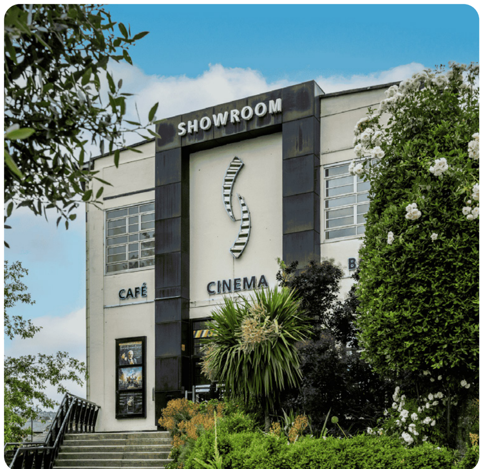
Right Showroom Cinema, Sheffield