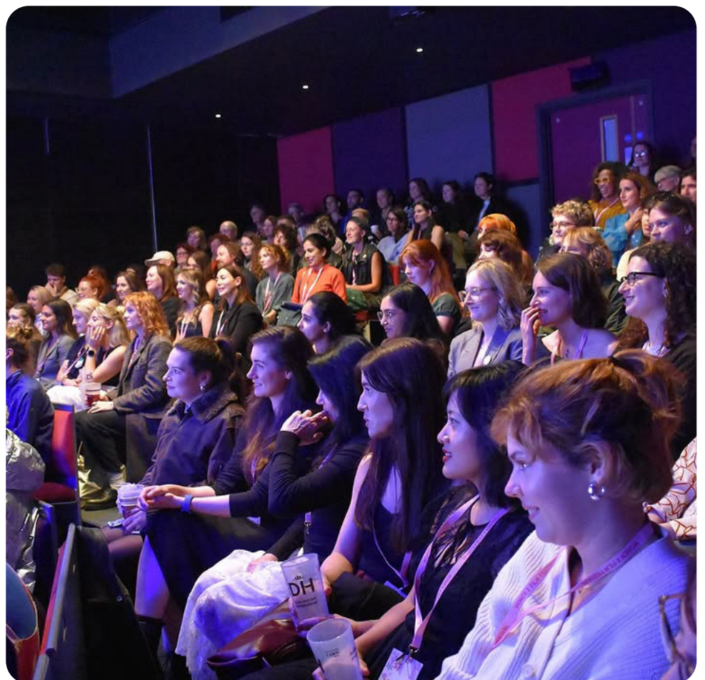
Right Women X