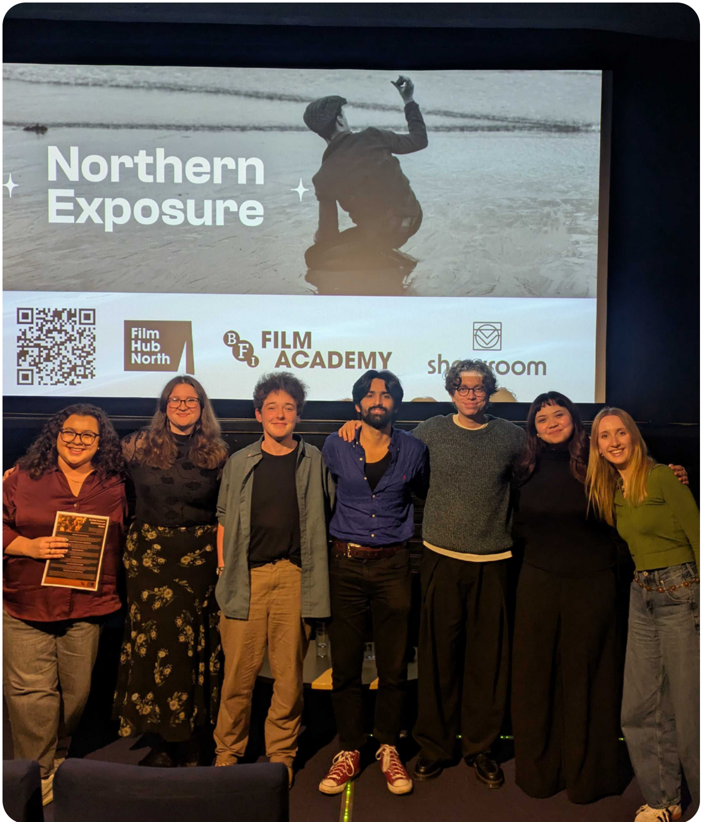
Above Northern Exposure