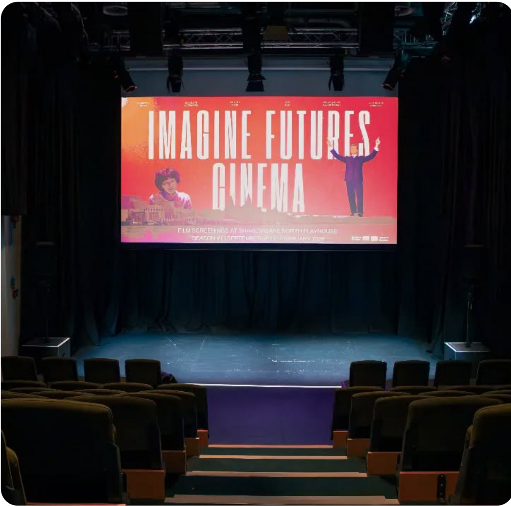
Above Imagine Futures Cinema