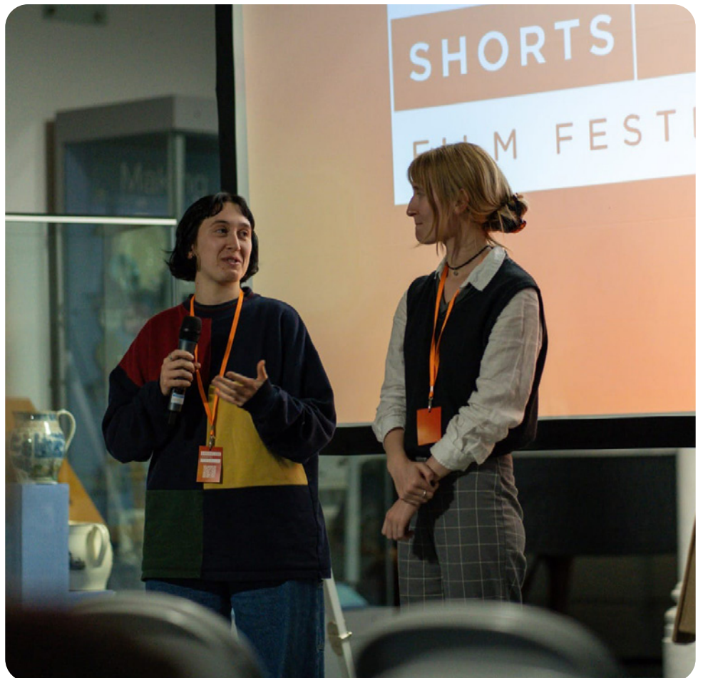
Right Sunderland Short Film Festival