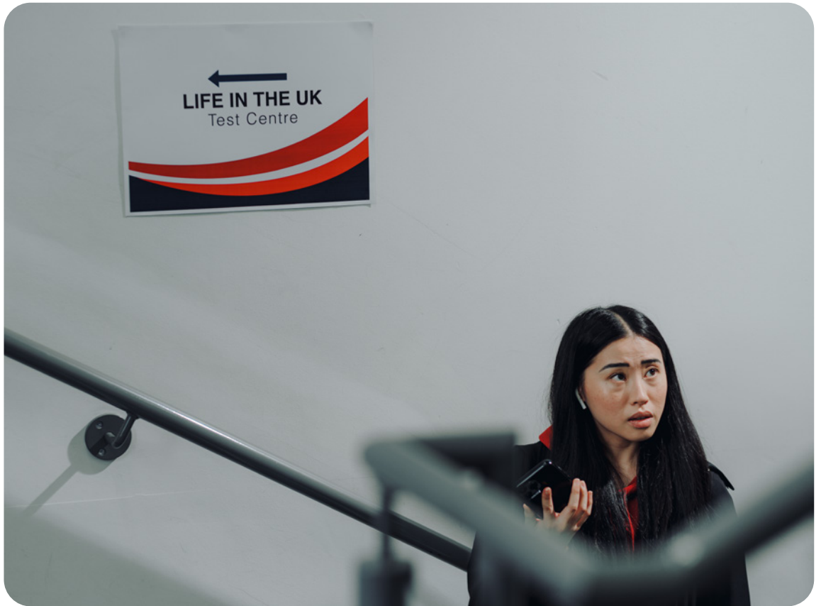
Right Still from The Test