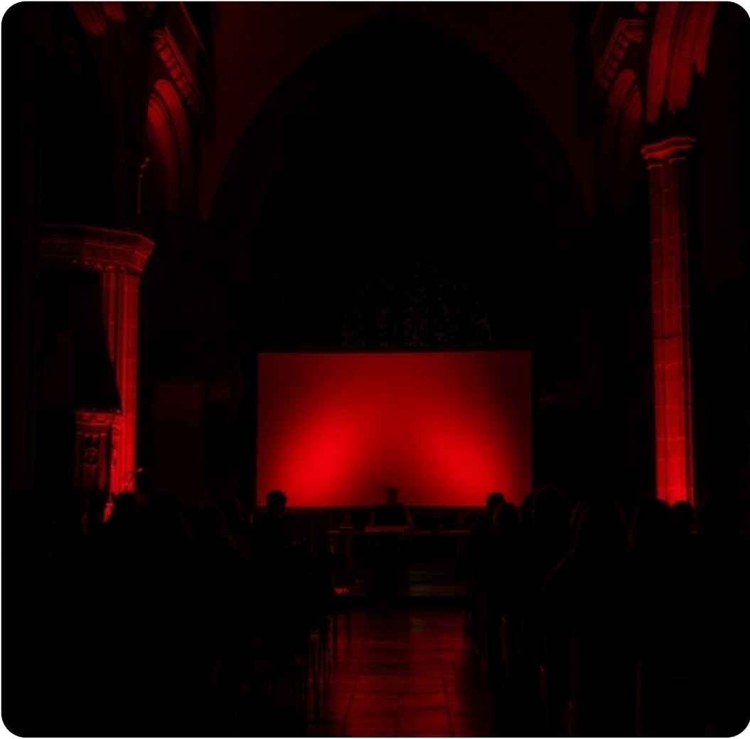
Above Sunderland Film Club