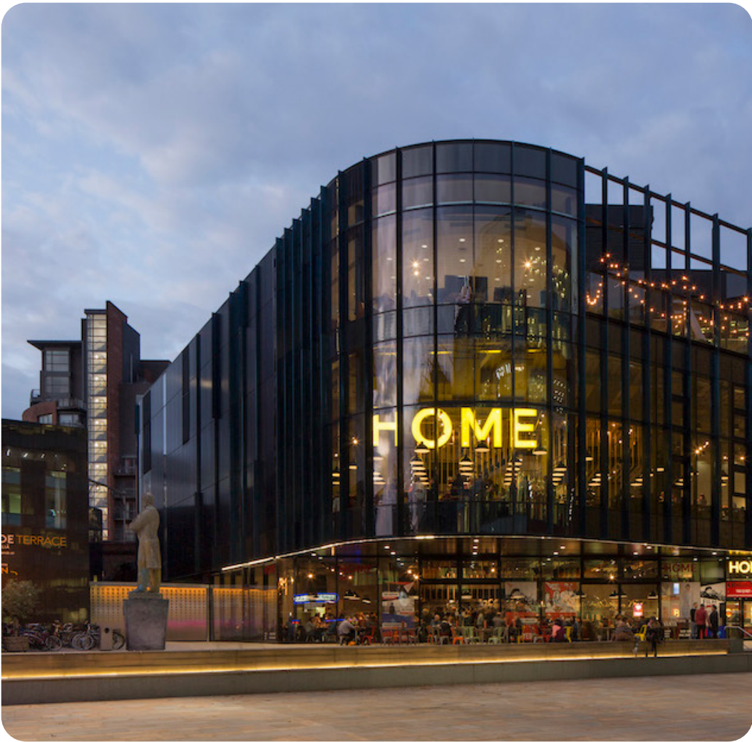
Above HOME Cinema, Manchester