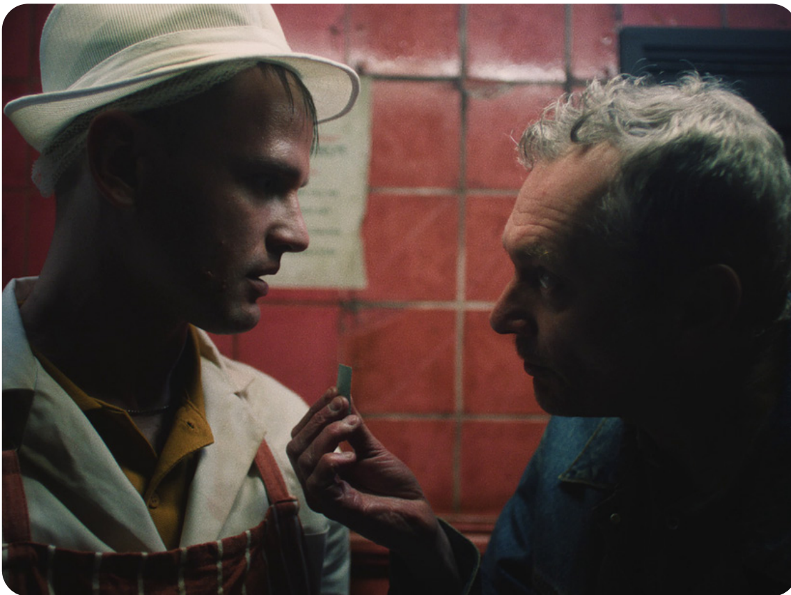
Left Still from Meat Raffle