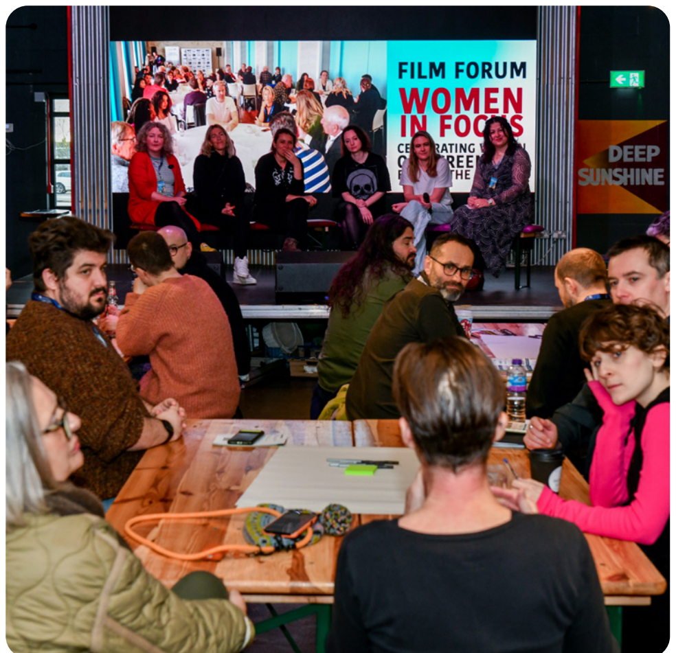
Above 100 Years of Community Cinema Cinema For All Gala