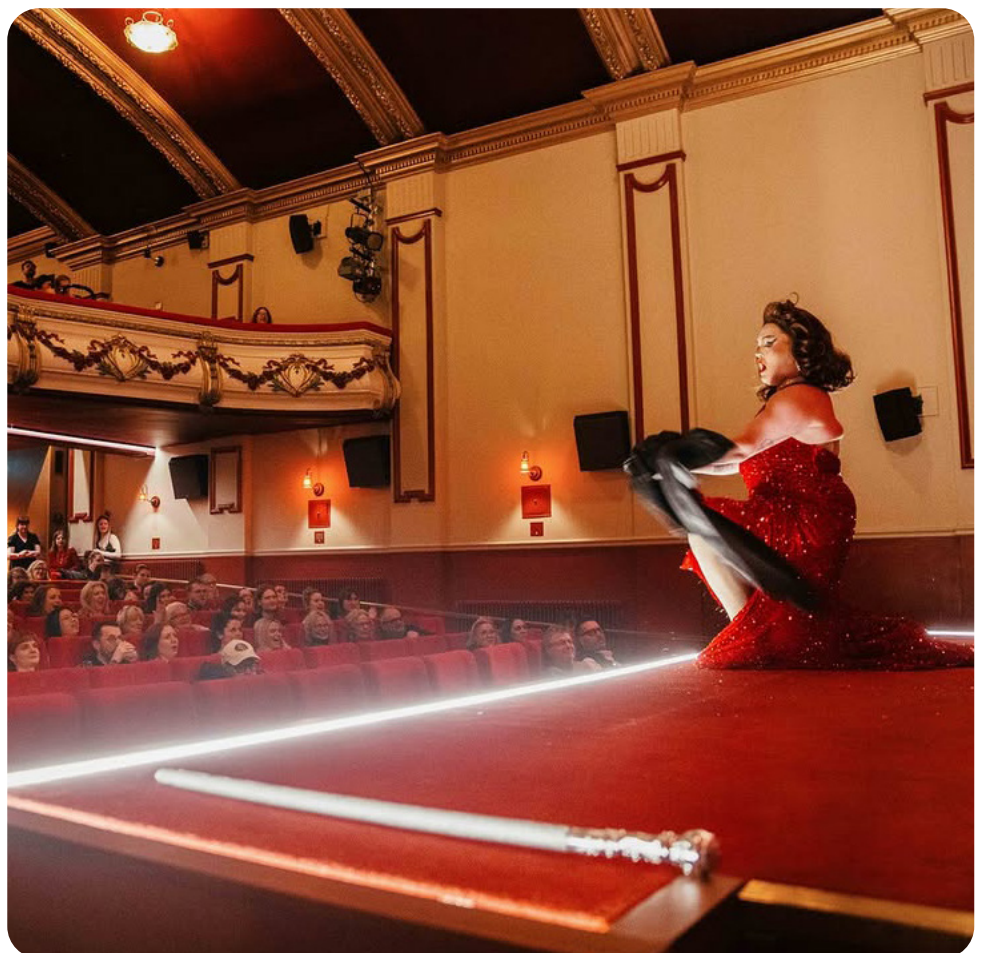
Right Melodrama, Hyde Park Picture House