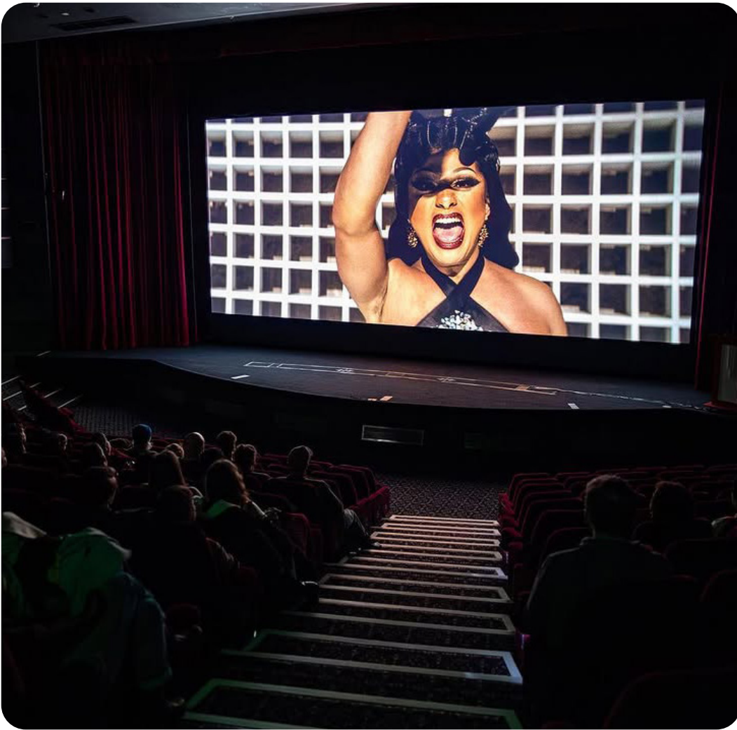
Above Bradford Queer Film Festival